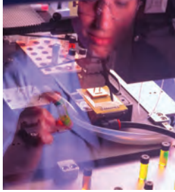
Laboratory resources for the development and evaluation of chem-bio sensors and systems

Draper's Chemical and Biological Defense Group works closely with sponsors and end users in the military, intelligence, first responder, public health, and homeland security arenas to design first-of-a-kind solutions to critical problems in defense and security.